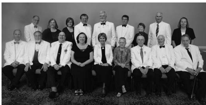
The 2017-2018 Lions of Illinois MD-1 Council of Governors and their partners.