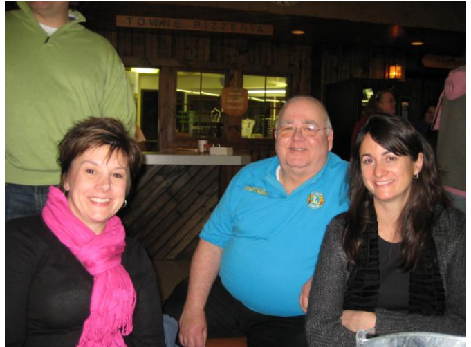
We had cheerleaders