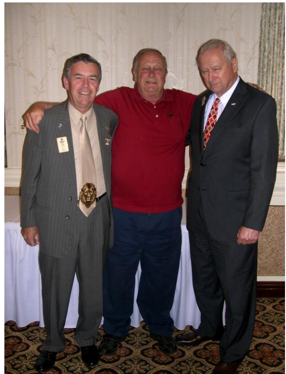
A NEW DISTRICT OFFICER RECURIT WITH HIS MENTORS