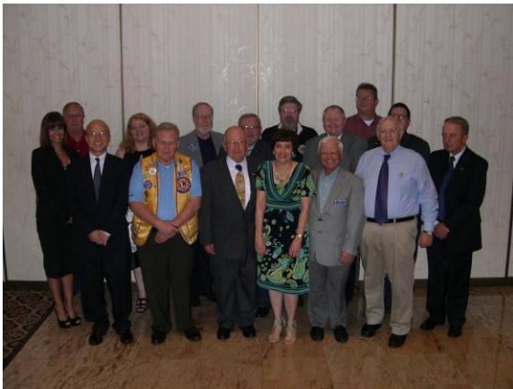
OUR NEWLY INSTALLED EXECUTIVE BOARD