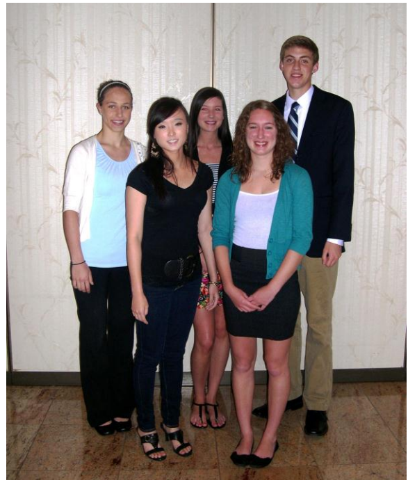
2011 SCHOLARSHIP RECIPIENTS