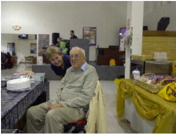
“When it comes to meeting challenges, our response is simple: WE SERVE.”

The meeting started at approximately 6:45PM.