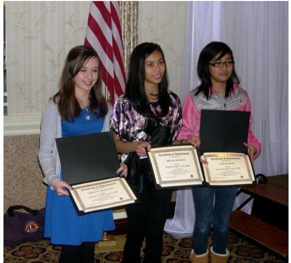
PEACE POSTER WINNERS