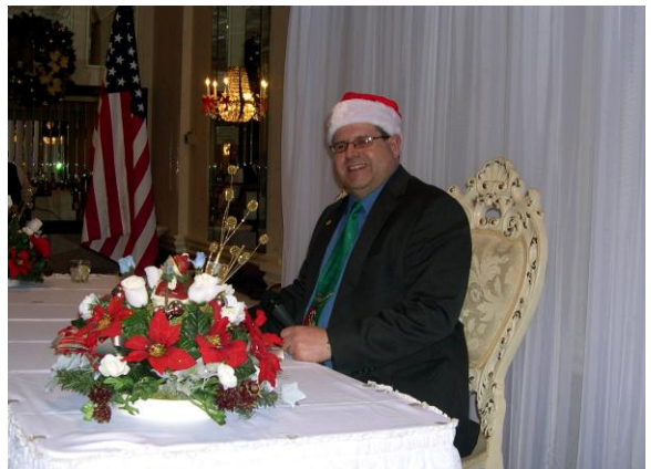
HIS MAJESTY, MR. A-EXPRESS