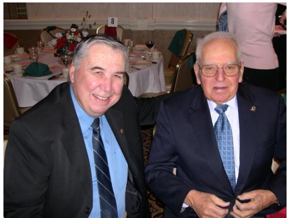
TWO YOUNG AT HEART GUYS