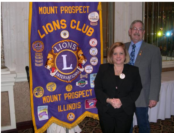
OUR ZONE CHAIR AND HER DRIVER