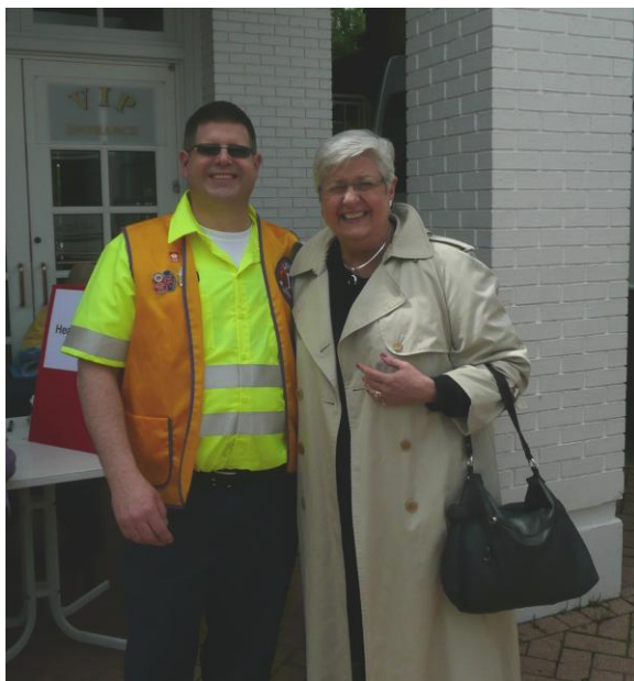
"SLIM" HOB NOBBING WITH THE VILLAGE BOSS