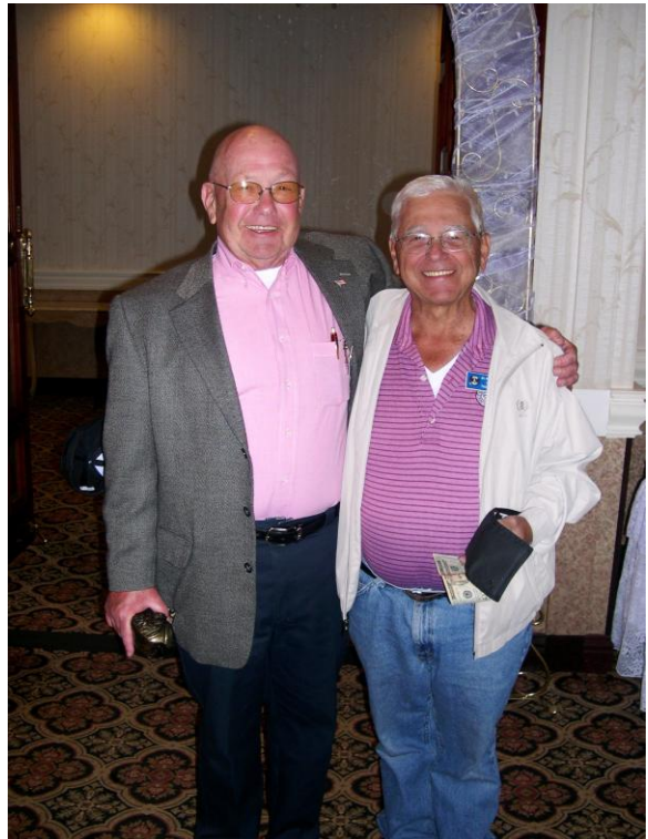
A THEIF AND HIS APPRENTICE OR TWO GIRLIE BOYS IN PINK