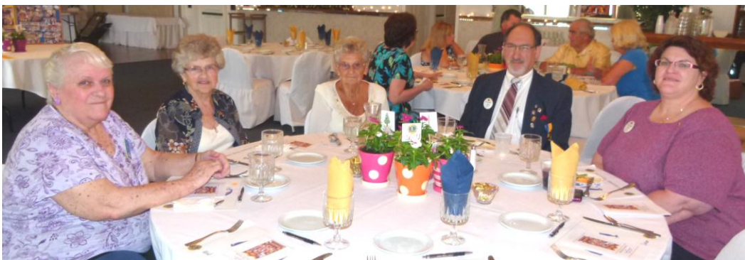
Friends of Gagewood!