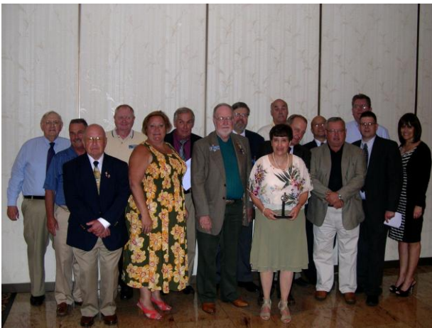
MEET YOUR NEW BOARD OF DIRECTORS