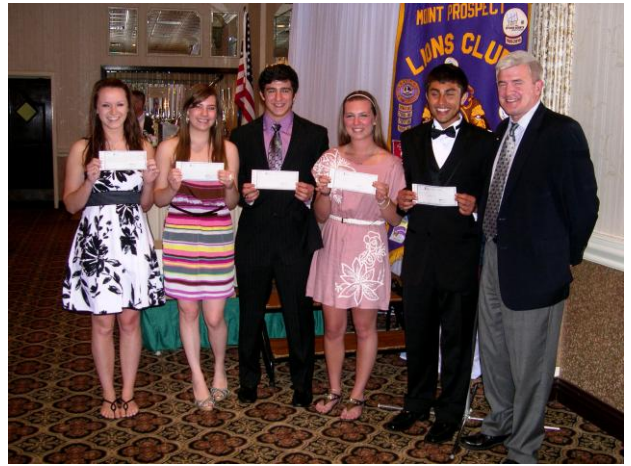
2012 SCHOLARSHIP RECIPIENTS