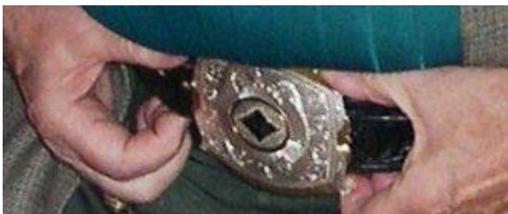
MY BUCKEL IS BIGGER THAN YOU BUCKEL

NO TEAM MATE ISSUES DURING THE SUMMER NEXT TEAM MATE IN SEPTEMBER. HAVE AN ENJOYABLE AND SAFE SUMMER