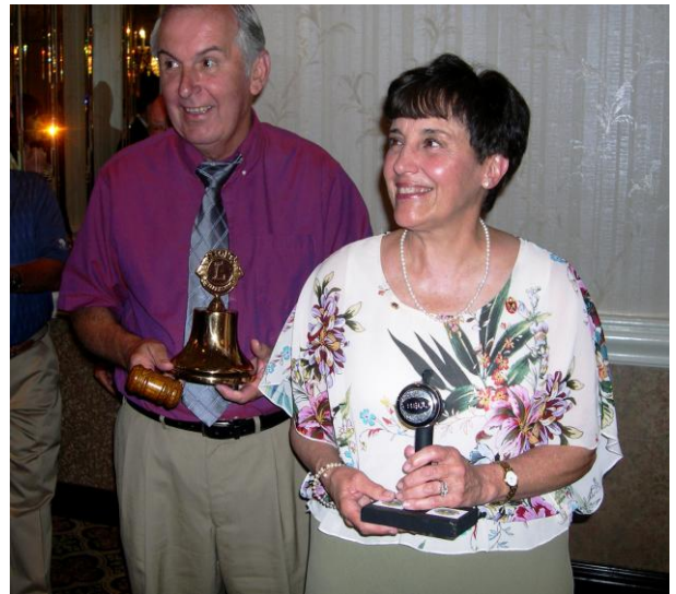
LOOK WHO IS PROTECTING THE BELL AND GAVEL FOR THE CHEIF