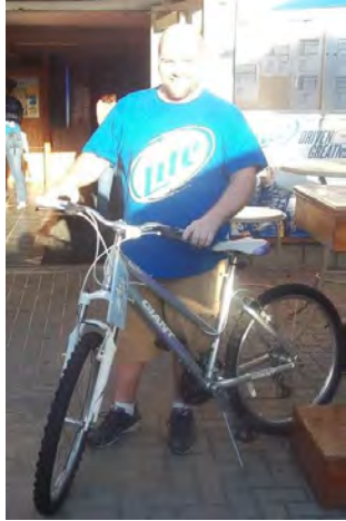
Bike raffle winner