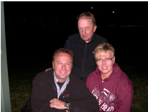
A POLITICAL GABE FEST