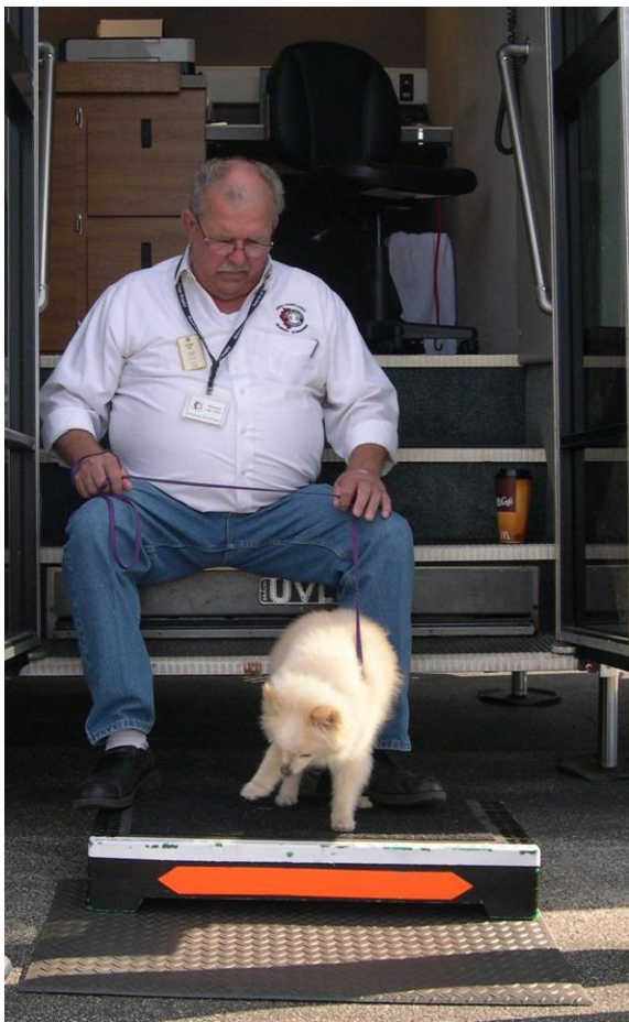
NOW YOU SEE WHY WE DID NOT SCREEN ANYBODY DO NOT BLAME THE LACK OF POWER.