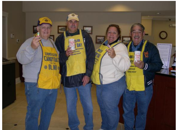
A FEW OF THE CANDY DAY CAN SHAKERS