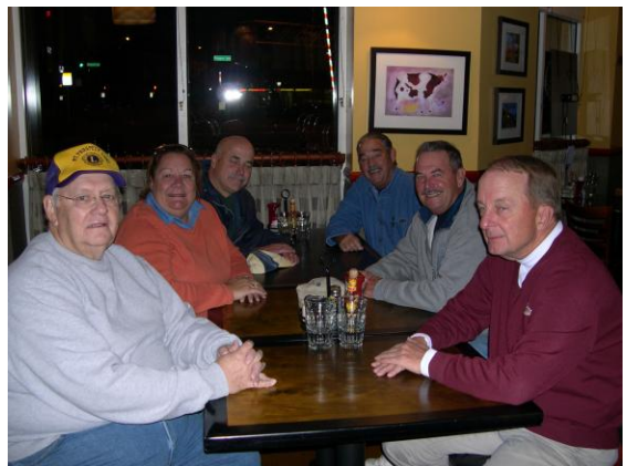
HERE WE SIT LIKE BIRDS IN THE WILDERNESS WAITING FOR OUR FOOD