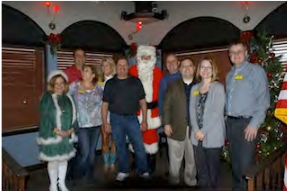
Lion Santa Says Happy Holidays!

January 8, 2013: Regular/Board Meeting at Clementi's at 7:00PM January 15, 2013: Regular Meeting CANCELLED January 14, 2013: Zone Meeting at Clementi's at 6:30PM