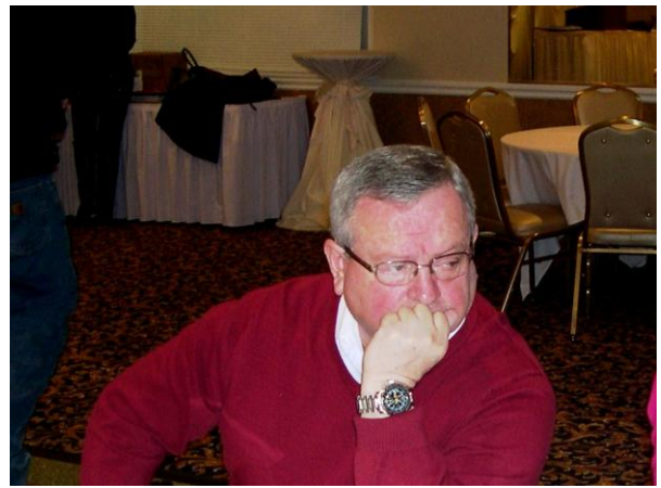
THE THINKER WHAT COULD I GET MY WIFE?

I used to wonder what it'd be like to read other people's minds. Then I got a Facebook account, and now I'm over it.