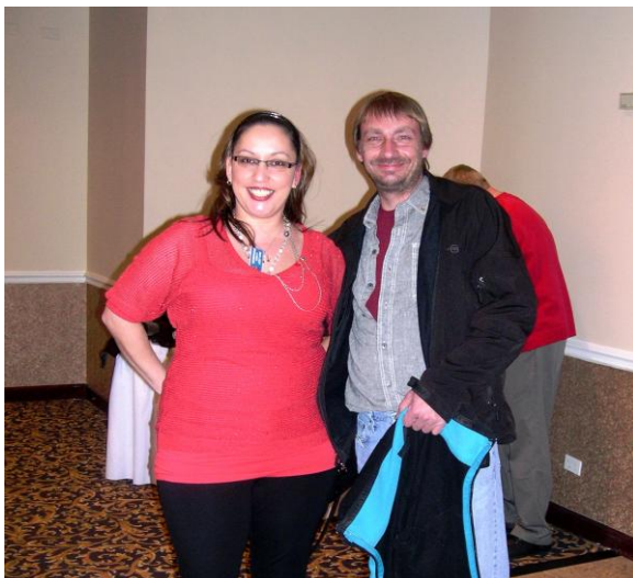
THE HAPPY COUPLE IN LOVE