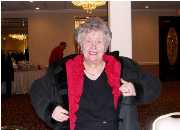
THE BIRTHDAY GIRL