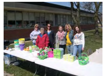
EGG HUNT FOR THE VISUALLY IMPAIRED