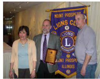
AN AWARD PRESENTED TO THE RETIRING PARK DIRECTOR