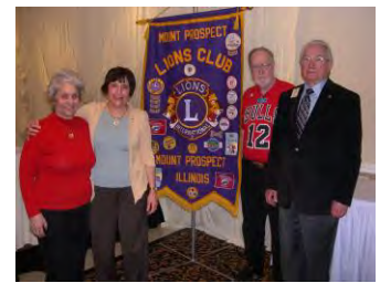
DIABETES AWARENESS CHAIRPERSON AND HIS WIFE WITH OUR PRESIDENT AND 1 ST VP