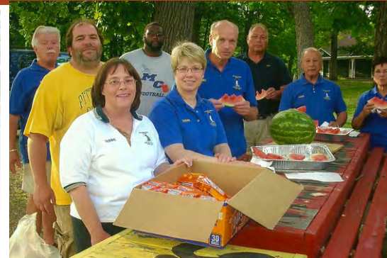
Winthrop Harbor Lions made many children happy during Camp Lions Treat Night in June.