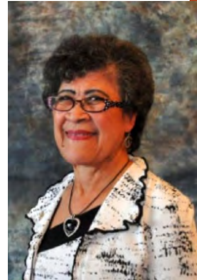
Take Pride in Service