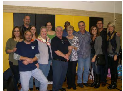
THE BOSCH CROWD