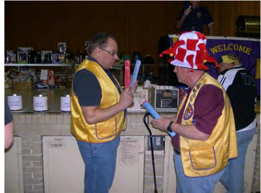
I AM ONLY SAYING THIS ONCE. THIS IS RED AND THIS IS BLUE