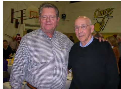
THE WHOSE WHO OF THE LIONS CLUB