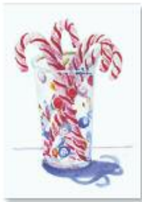
2014 Braille Holiday Card