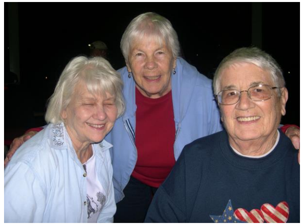
THREE WISE SENIORS AND NOT HIGH SCHOOL