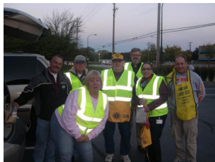
6:00 AM CAN SHAKERS