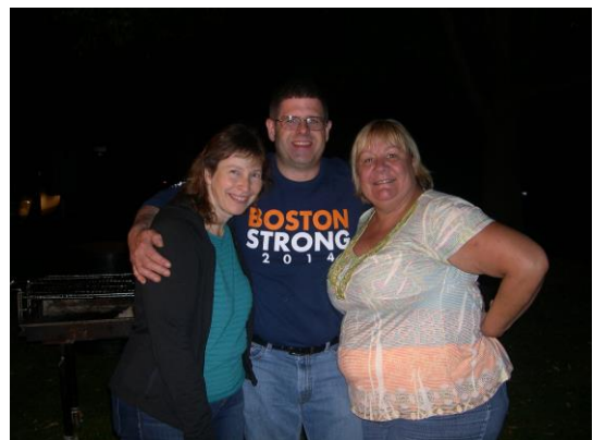
THIS IS EITHER A ROSE BETWEEN TWO THRONS OR A THRON BETWEEN TO ROSES.