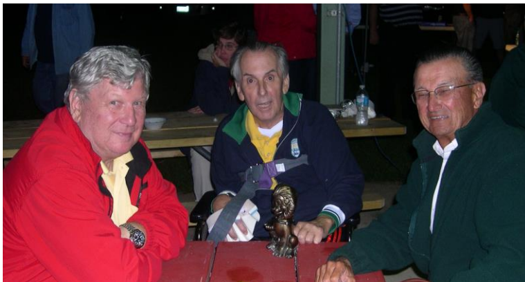
LOOK WHO'S WATCHING THE TAIL TWISTER'S LION? AN UNKNOWN, A HAPPY GO LUCK GUY AND A PILL PUSHER