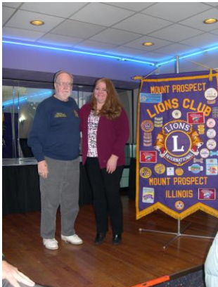
OUR 3 RD VICE PRESIDENT AND INSTALLING OFFICER