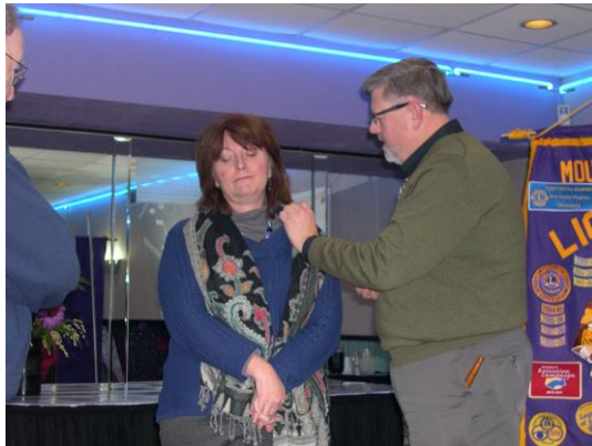
OUR NEWEST MEMBER AND HER SPONSOR