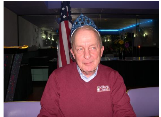
"BUSINESSMAN OF THE YEAR" AND HIS CROWN