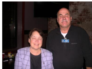
ZONE CHAIR AND OUR PRESIDENT