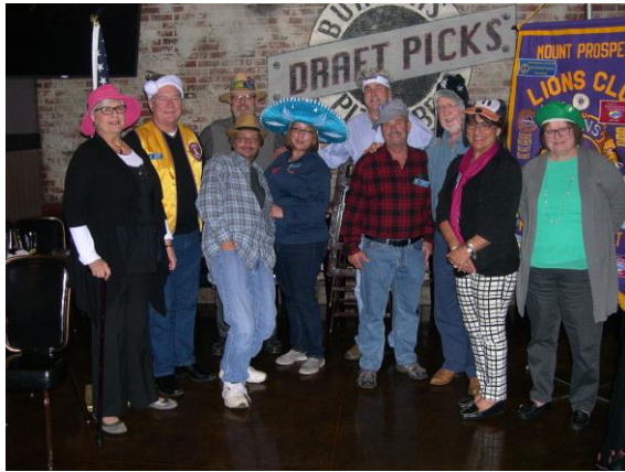
THE CRAZY HAT CROWD