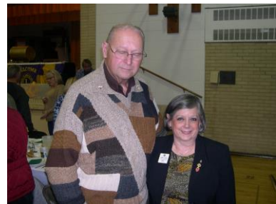
CORNEB BEEF AND CABBAGE DINNER