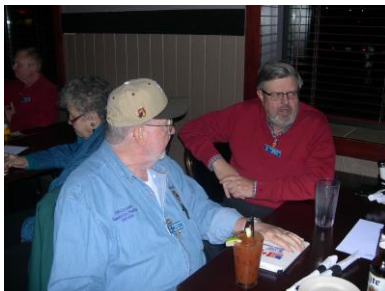
A LIVELY CONVERSATION