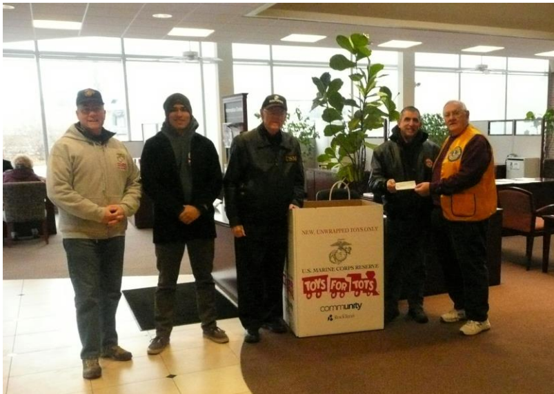
TOYS FOR TOTS PRESENTATION