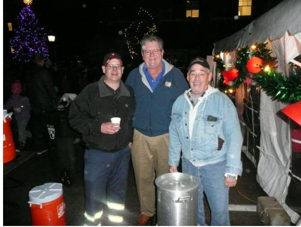
THE TREE LIGHTING GANG