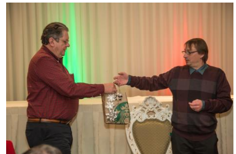
2016 LIONS CHRISTMAS PARTY