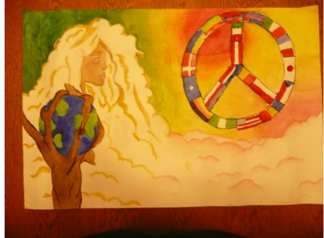
CLUB'S WINNING PEACE POSTER