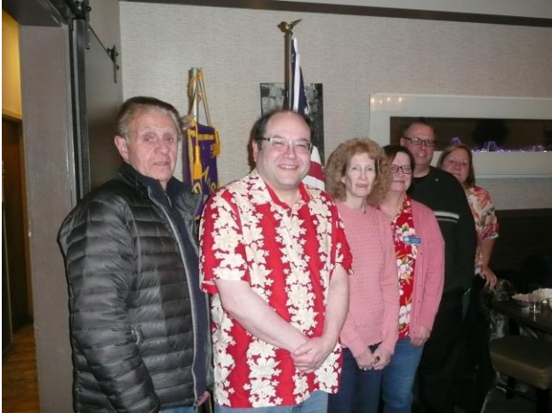
MEET OUR NEWLY INSTALLED MEMBERS WITH THEIR SPONSORS