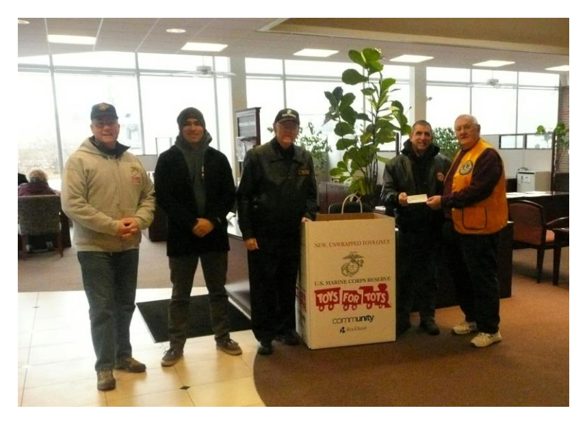
TOYS FOR TOTS PRESENTATION