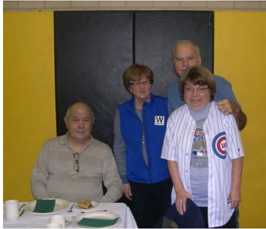
NEIGHBORHOOD CUB FAN AT THE CBC DINNER