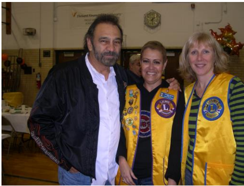
FRIENDLY LIONS AND THEIR FRIEND