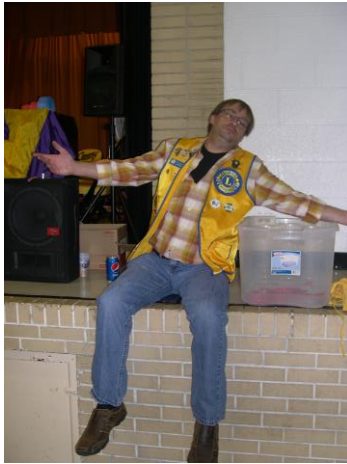
OUR PRESIDENT HARD AT WORK