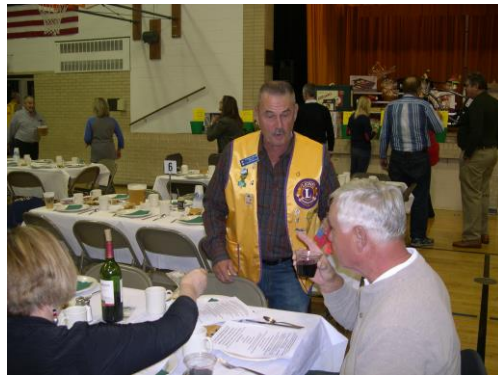
MISTER, PLEASE BUY SOME RAFFLE TICKETS FROM ME I AM WORKING MY WAY THROUGH LION COLLEGE