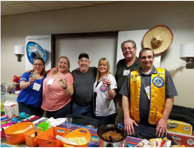
THE LITTLE VILLAGE TEAM MUJERES Y HOMBRES HAMBRIENTOS